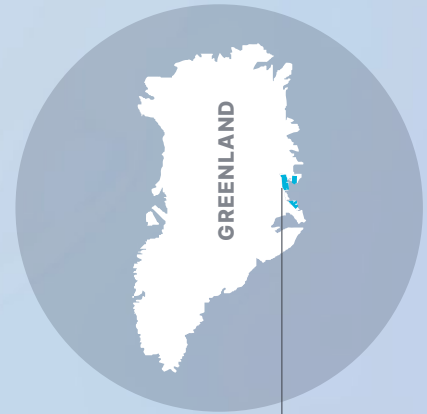
Frontier Project IGO up to 80%