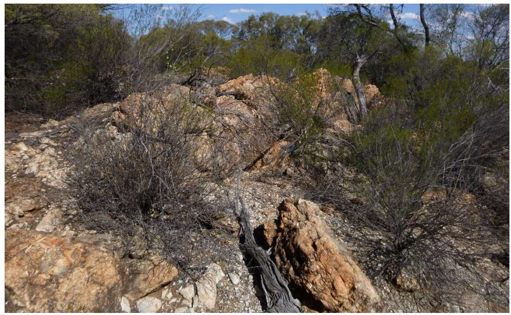
Gently north dipping pegmatite dyke at Emerald SE (location 268750E, 6723285N).

This announcement is authorised by the Board of Venus Metals Corporation Limited.