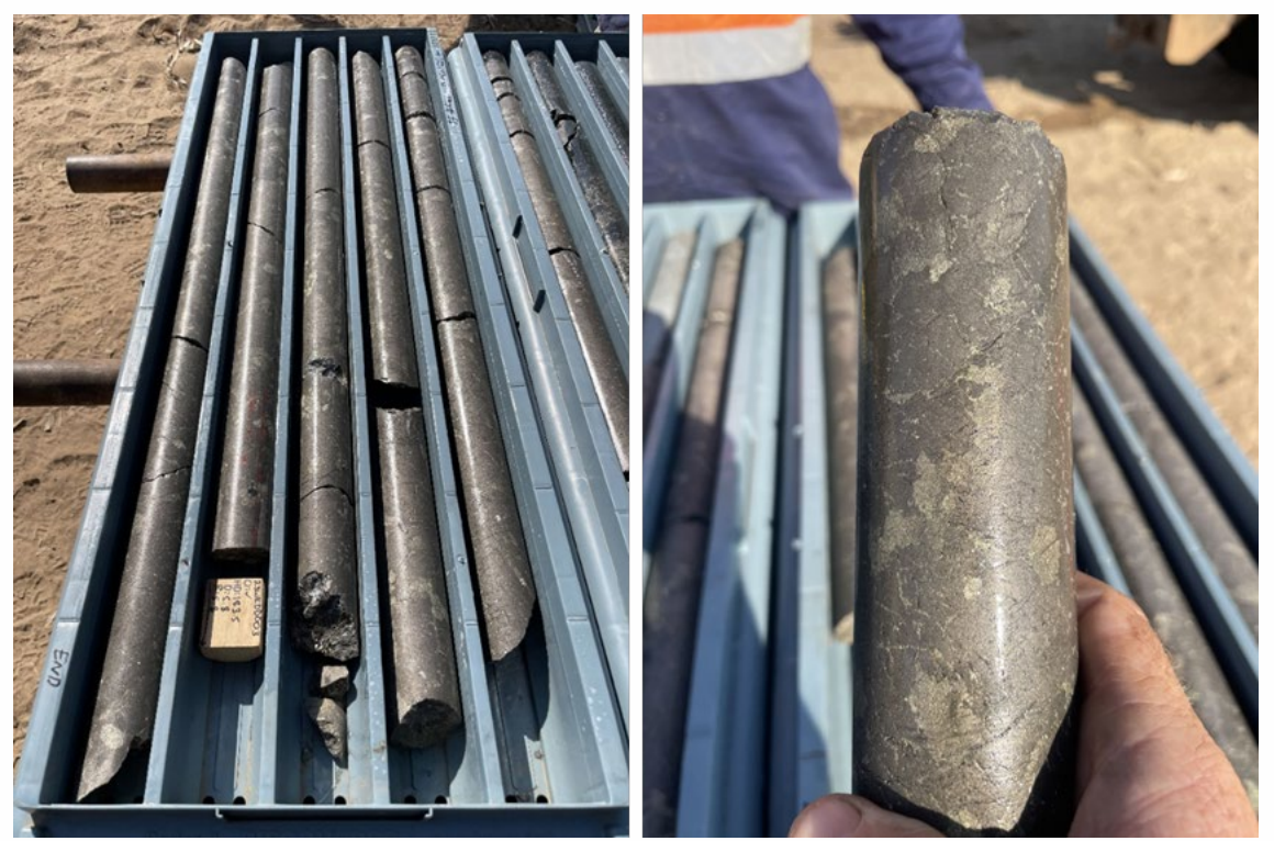
Figure 1: 23WKDD003 at 179.1 m - massive sulphide mineralisation with visually logged Ni and Cu sulphides.

Buxton Resources (ASX:BUX) is pleased to announce that its joint venture partner IGO Limited (ASX:IGO) has intersected massive sulphide mineralisation (Figure 1) at the Dogleg Prospect (IGO (64%), Buxton Resources (16%), Timothy Tatterson (20%)) located approximately 13 km northwest of the previously identified Merlin Ni-Cu Prospect (Figure 2).