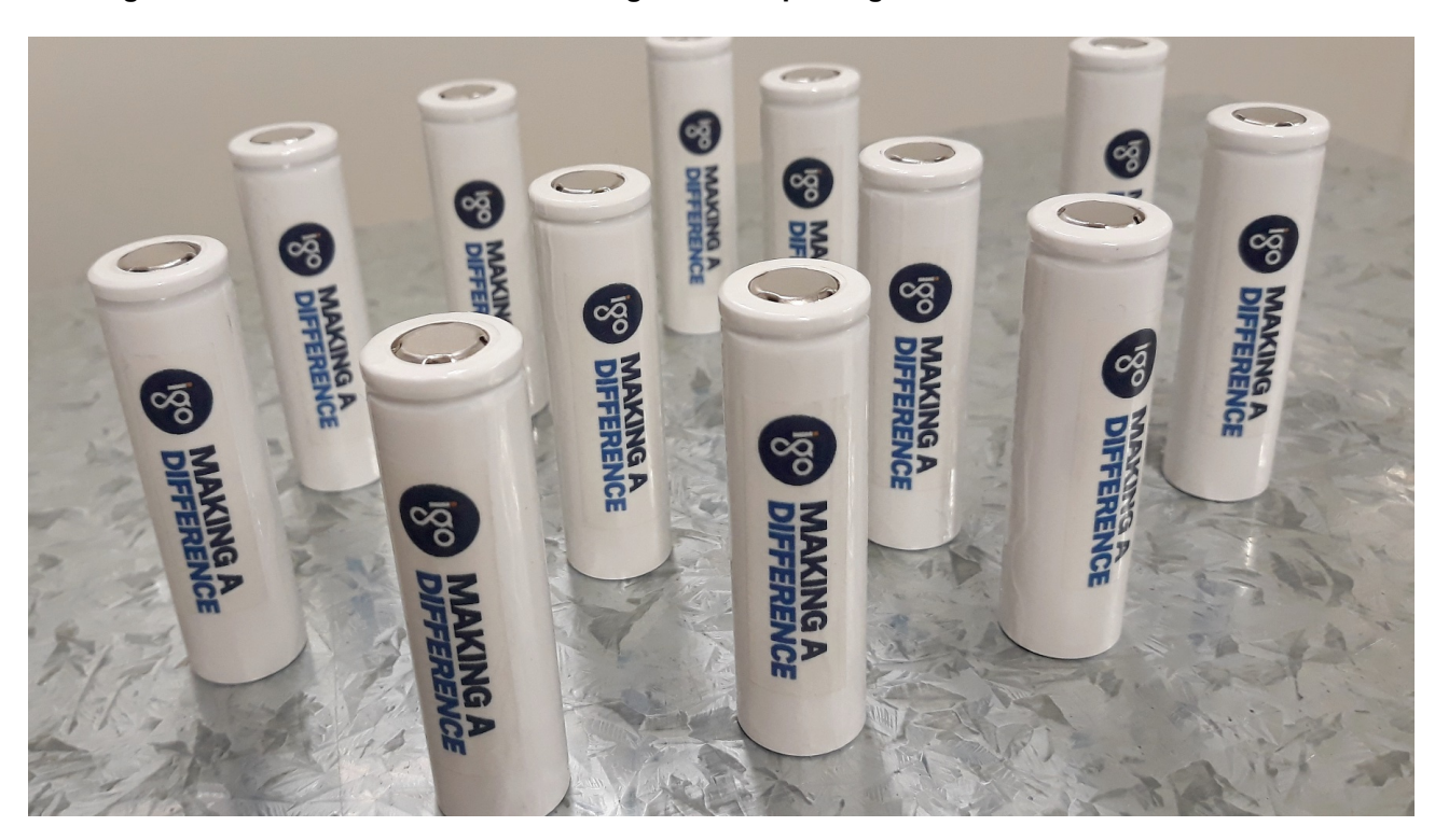
Figure 1 - Lithium-ion batteries utilising nickel sulphate generated from The IGO Process™

As part of the Study, IGO has completed extensive testwork to confirm the application of The IGO Process™ including the production of trial lithium-ion batteries by Queensland University of Technology utilising the raw nickel sulphate generated from The IGO Process™. This has provided greater confidence in The IGO Process™ and its ability to produce battery grade nickel sulphate for the premium energy storage market.