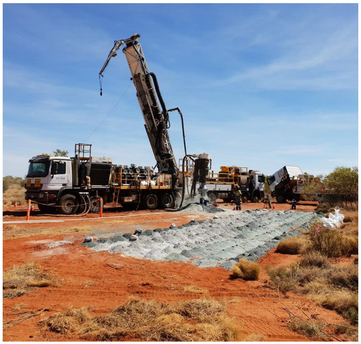
Figure 1 - RC drilling at the Lake Mackay Project, April 2019

"Further, we can report the Lake Mackay Project area has been increased by 50% via new exploration licence applications to ensure that prospective surrounding areas that host rocks of potentially similar age to mineralisation intersected at the Grapple Prospect are now included in the project".